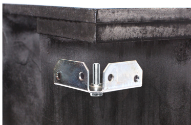
Corner Mounting Bracket