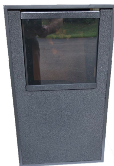
VRA Positioned on top