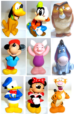
Currently Available Toys*

All new production will incorporate magnetic connectors on each toy and the mounting base inside the unit to change toy figures easily.